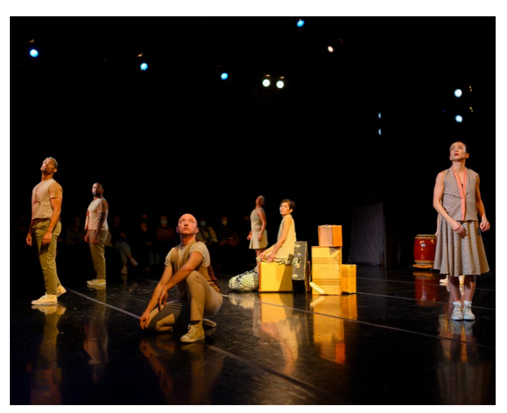
KAMBARA+'s "IKKAI means once: a transplanted pilgrimage."