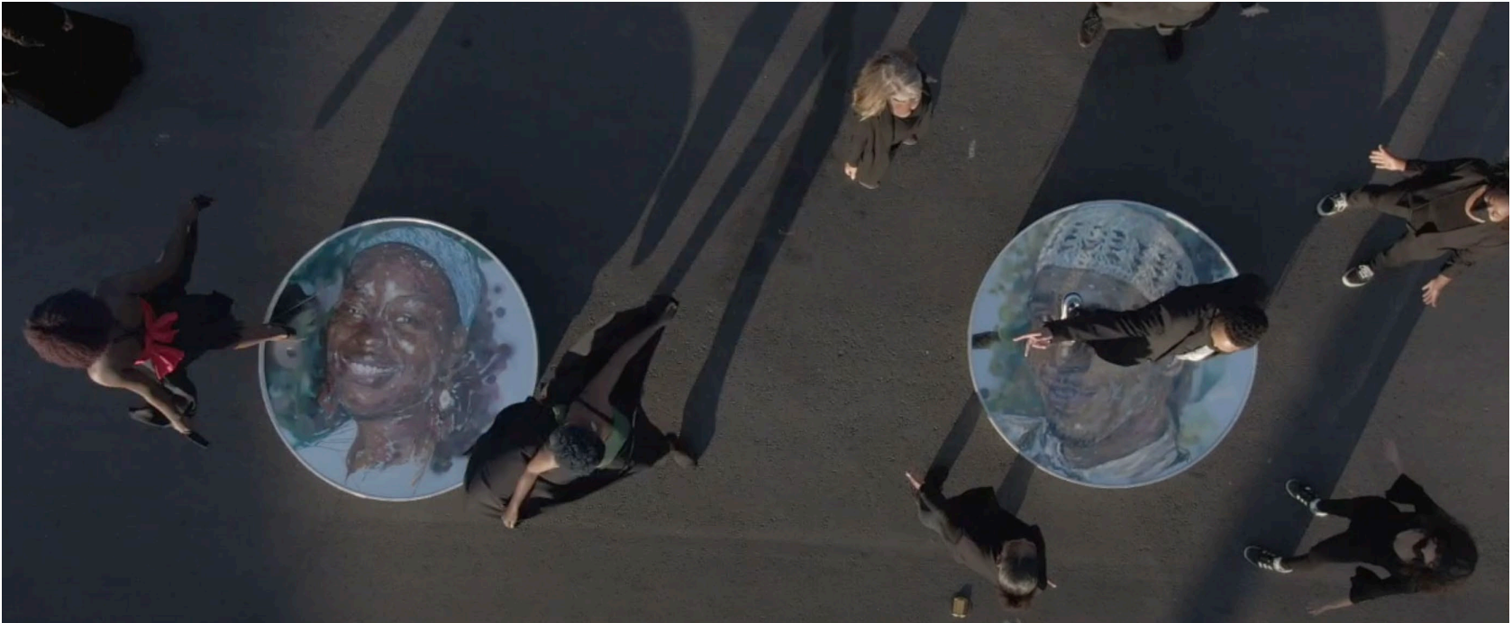
Destiny Arts Center's "THE BLACK (W)HOLE."