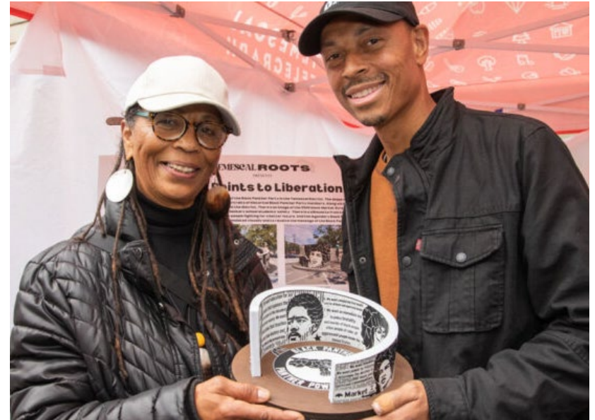
"Temescal Roots Project."