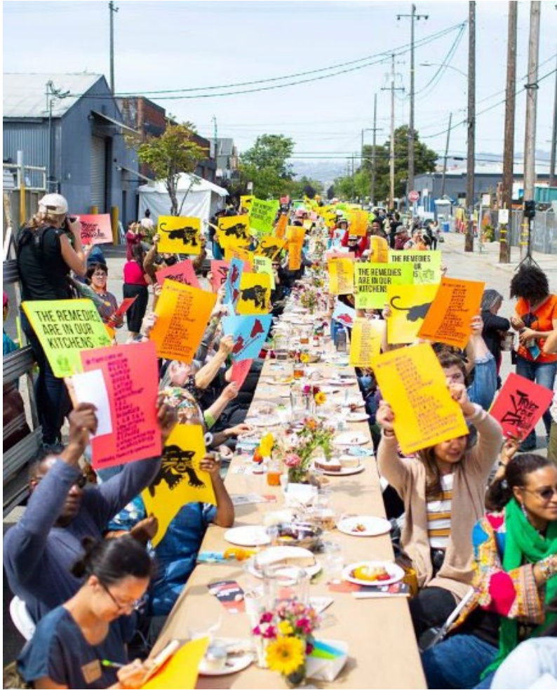
People's Kitchen Collective's "To the Streets."