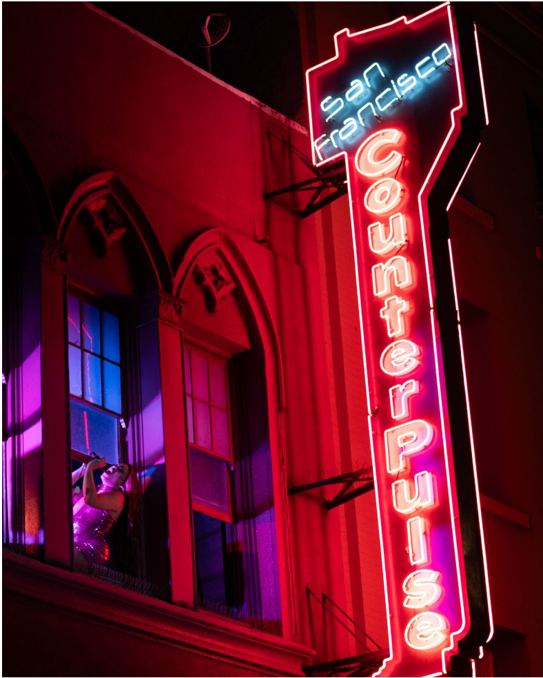
Amoura Teese in "The Show."