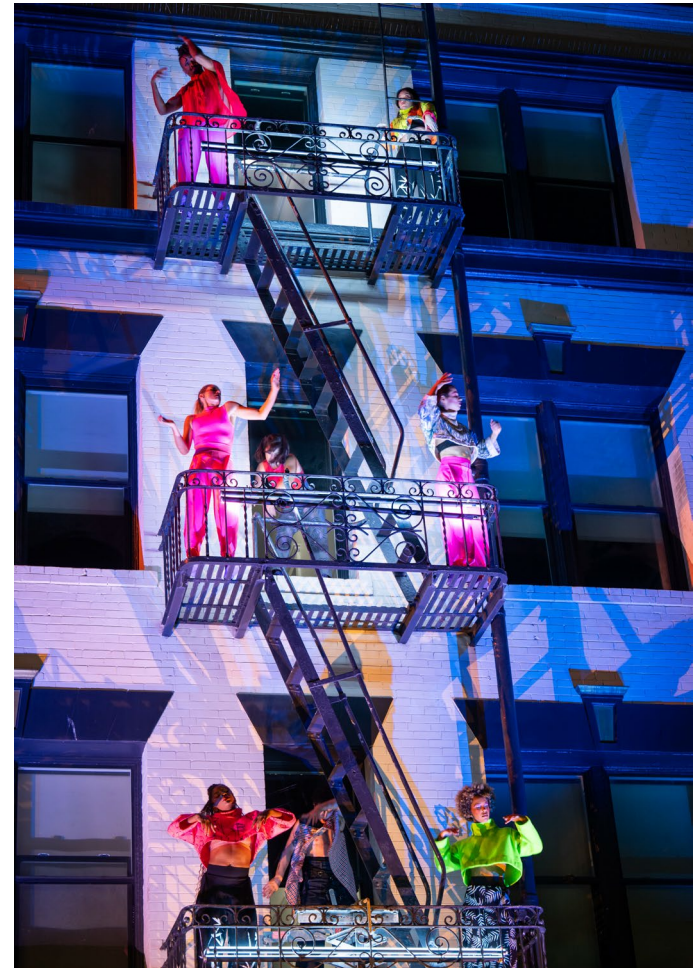
Flyaway Production's "Down on the Corner."